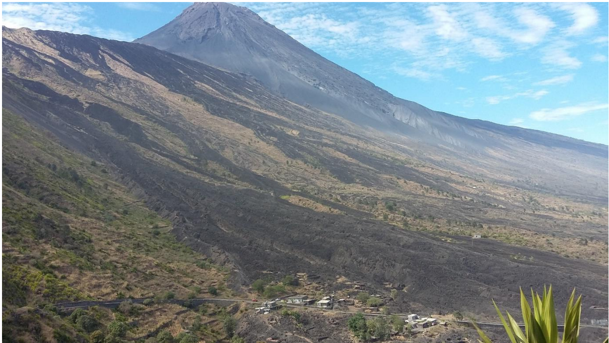
Fogo volcano

This event is free of charge, but registration is essential, priority will be given to Fellows and Student Fellows of the Geological Society who are members of the Home Counties North Regional Group. Fellows and Student Fellows of all other Geological Society Regional Groups are welcome to register their places, also free of charge.