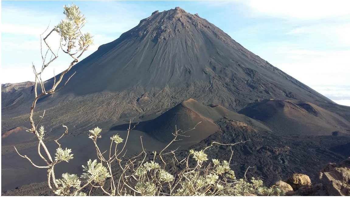
Fogo volcano